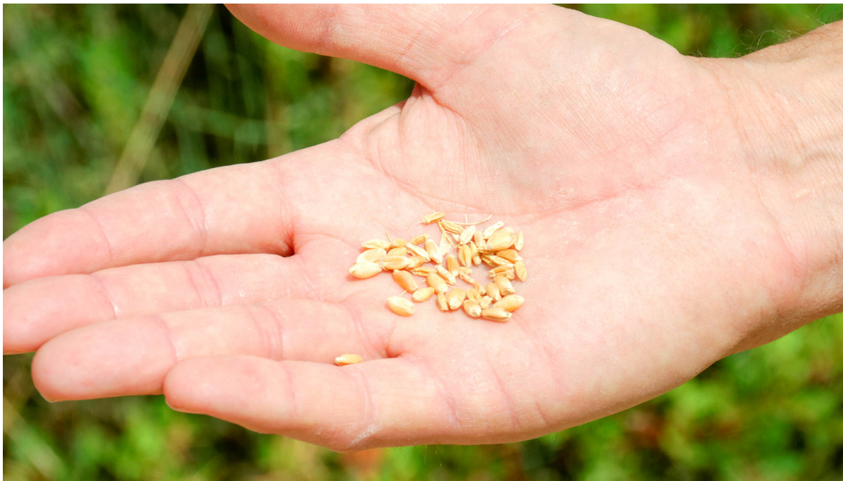
Kernels of wheat in hand

His disciples began to pluck heads of grain and to eat