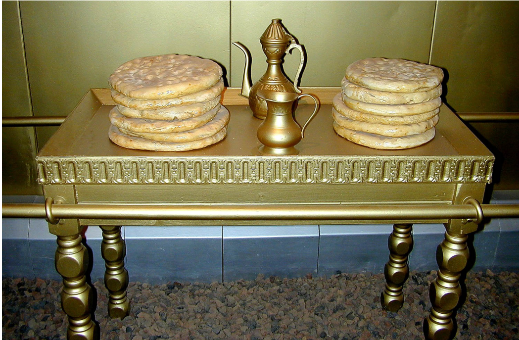
Table of showbread in a tabernacle model

He entered into the house of God, and ate the showbread