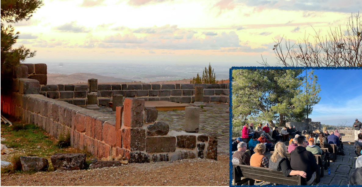
Ancient synagogue reconstructed at Yad HaShmonah

And going on from there (on another Sabbath), He entered their synagogue