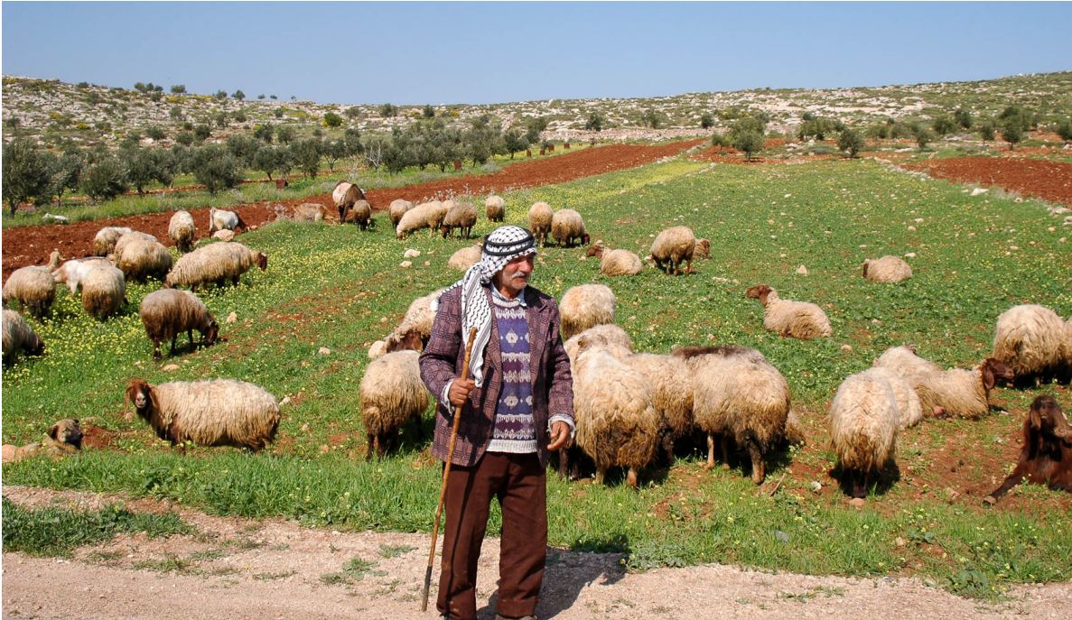
Shepherd with sheep in eastern Samaria

HOW MUCH MORE is a person valuable than a sheep!