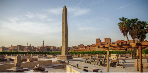
Obelisk of Senusret I, 12th dynasty, Tell Hisn, Heliopolis

Asenath, daughter of Potiphera, priest of On. So Joseph went out over the land of Egypt.