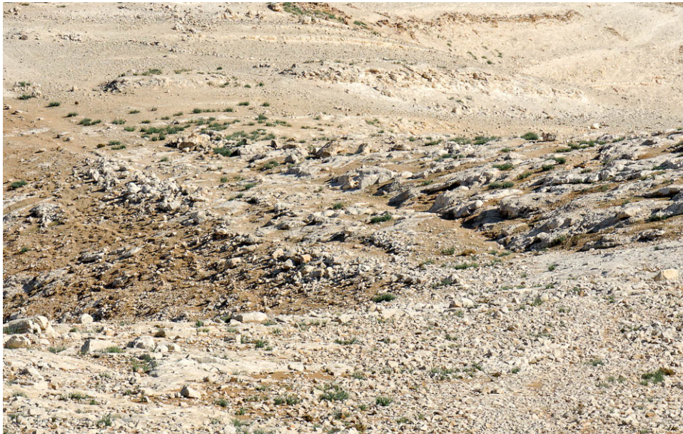
Stones in the Judean wilderness