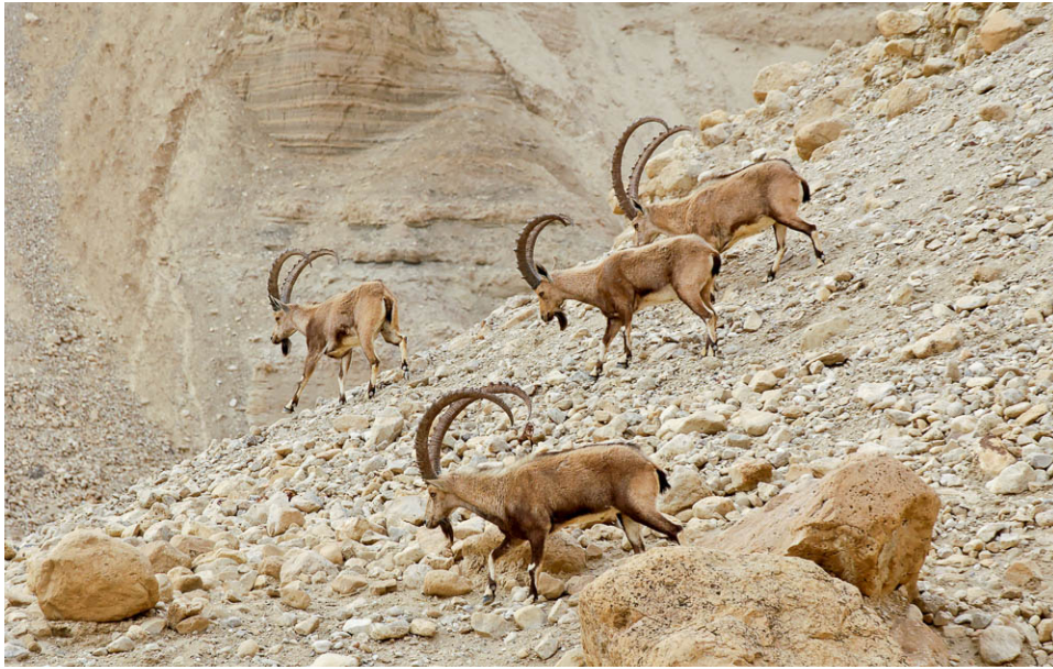
Ibex male herd at En Gedi