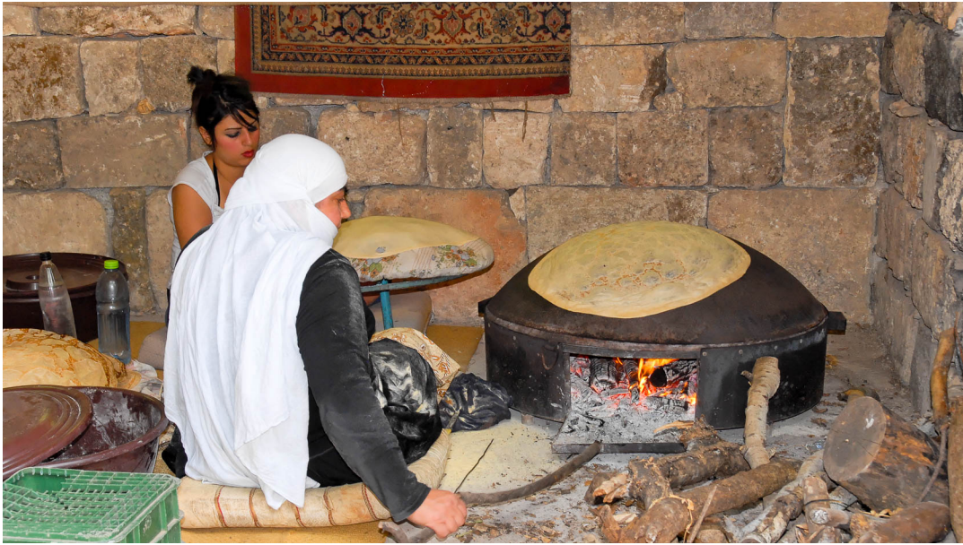
Druze baking bread in Baniyas