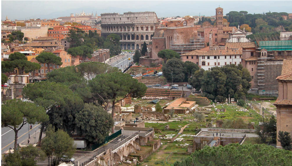
Forum and Colosseum (from the north)

The devil . . . showed Him all the kingdoms of the world, and the glory of them