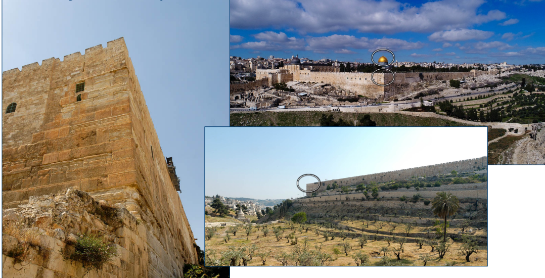
The southeastern corner of the Temple Mount

Then the devil took Him to the holy city, and set Him on the pinnacle of the temple