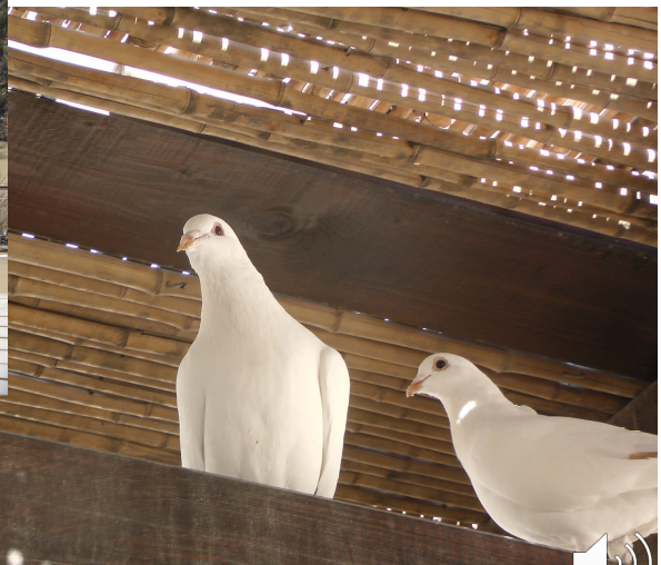
Doves at Jesus traditional Baptism site