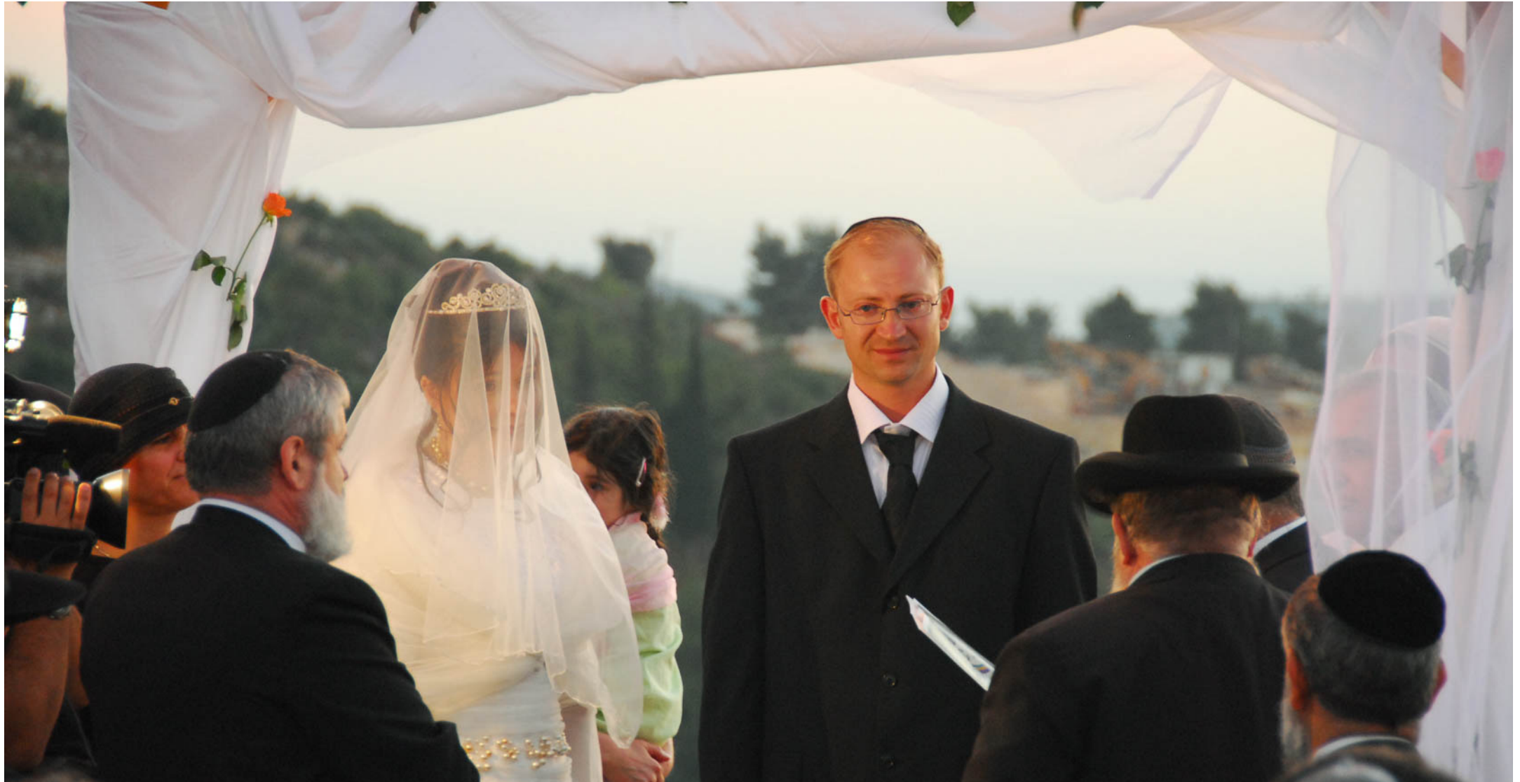
Bride and groom at an Orthodox Jewish wedding near Jerusalem

Joseph . . . Do not fear to take her as your wife