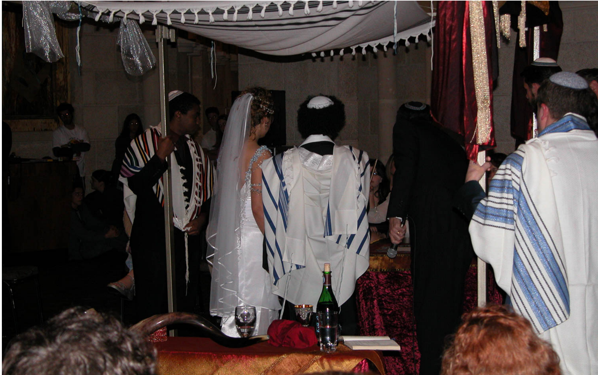
Bride and groom at a Jewish wedding in Jerusalem