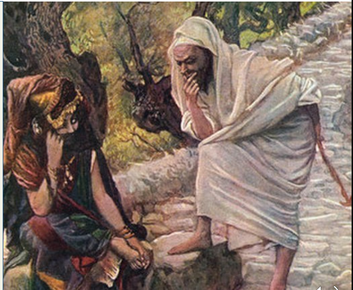
Judah and Tamar (Genesis 38)

Gen 38:24-26 About three months later Judah was told, “Tamar your daughter-in-law ...is pregnant by immorality.” And Judah said, “Bring her out, and let her be burned.” As she was being brought out, she sent word to her father-in-law, ...And she said, “Please identify whose these are, the signet and the cord and the staff.” Then Judah identified them and said, “ She is more righteous than I , since I did not give her to my son Shelah.”