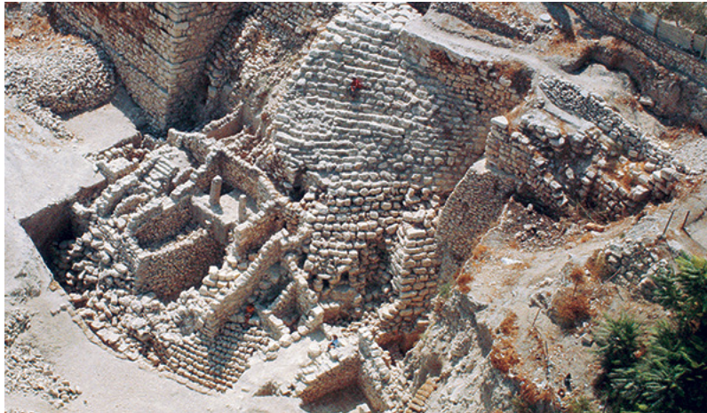
The “wife of Uriah”

And David was the father of Solomon by the wife of Uriah