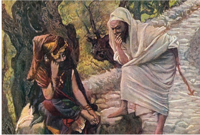
Judah and Tamar (Genesis 38)