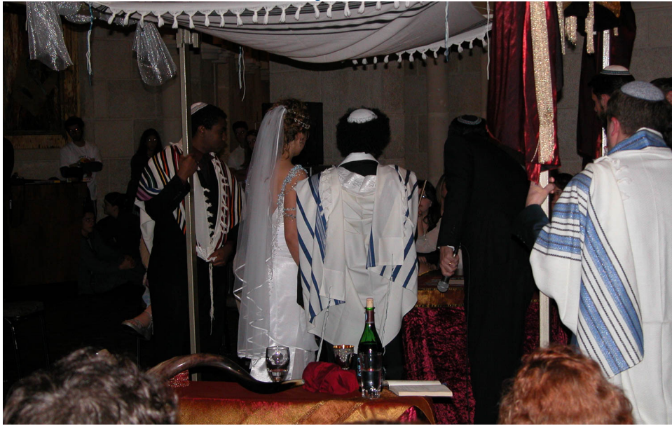
Bride and groom at a Jewish wedding in Jerusalem