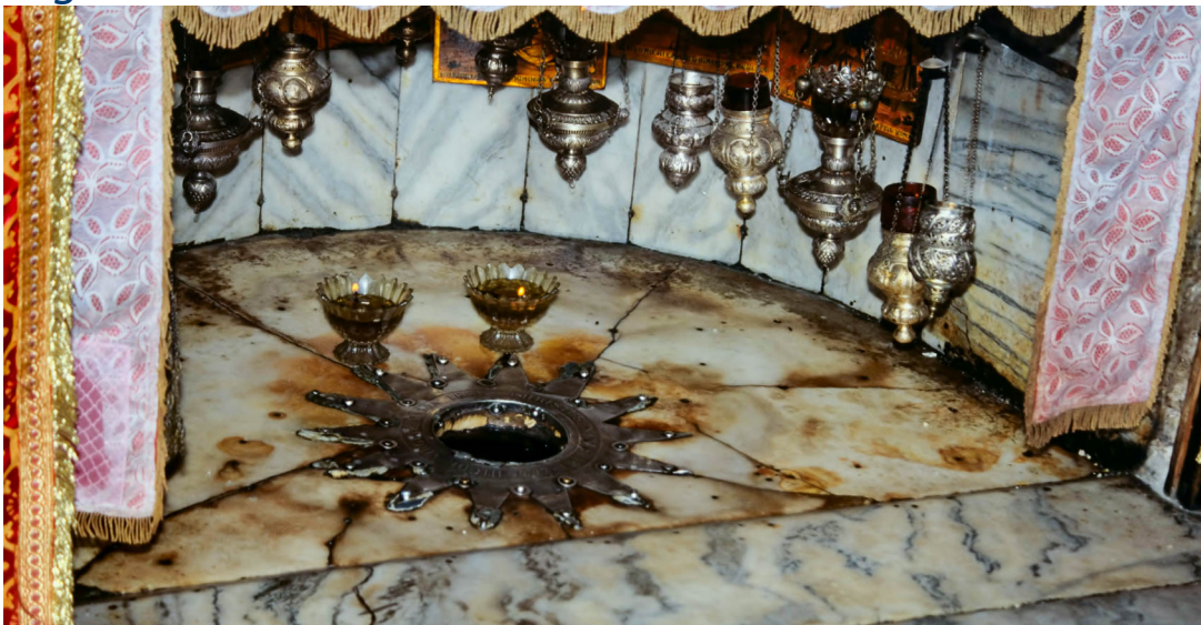
Star marking the place of Jesus's birth in the Church of the Nativity, Bethlehem

She gave birth to a son. And he called His name Jesus