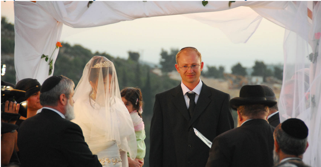
Bride and groom at an Orthodox Jewish wedding near Jerusalem