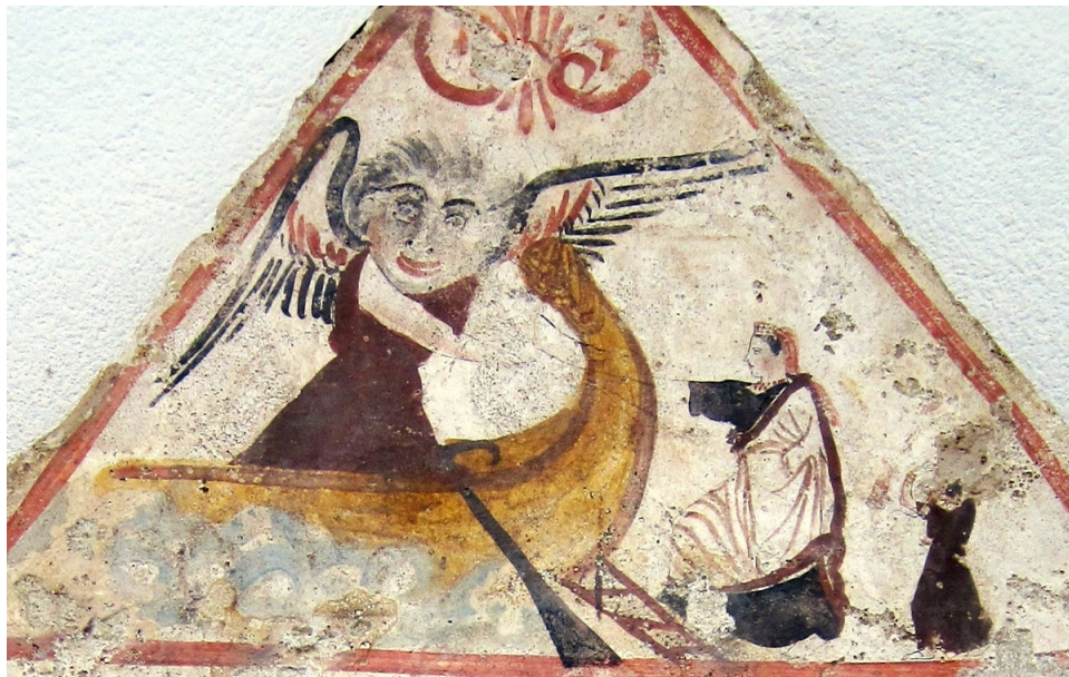
Charon ferrying souls to Tartarus, from Lucania in southern Italy, circa 4th century BC

For if God did not spare the angels when they sinned, but cast them into hell