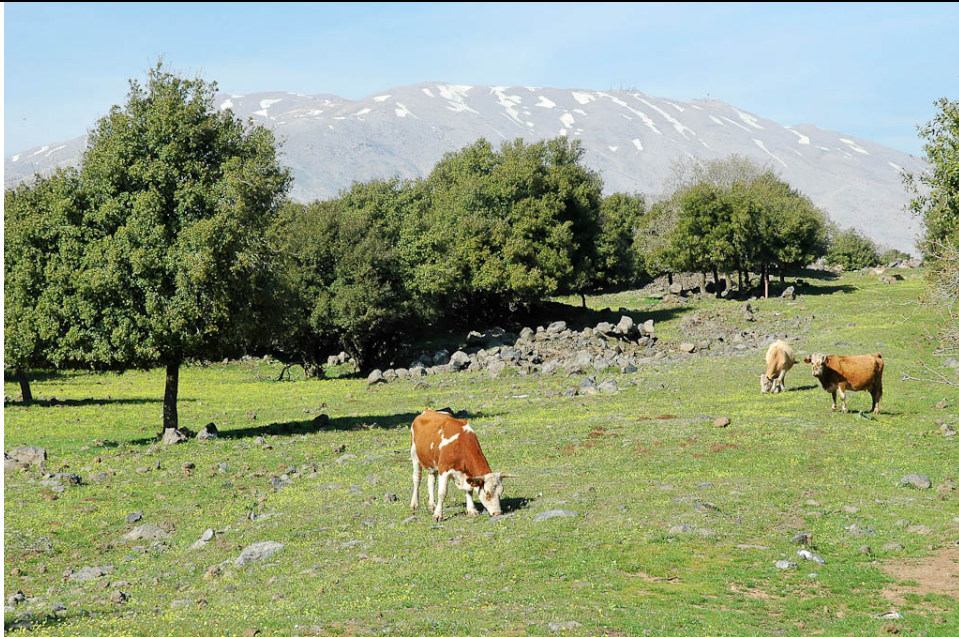
Cows of Bashan with Mount Hermon