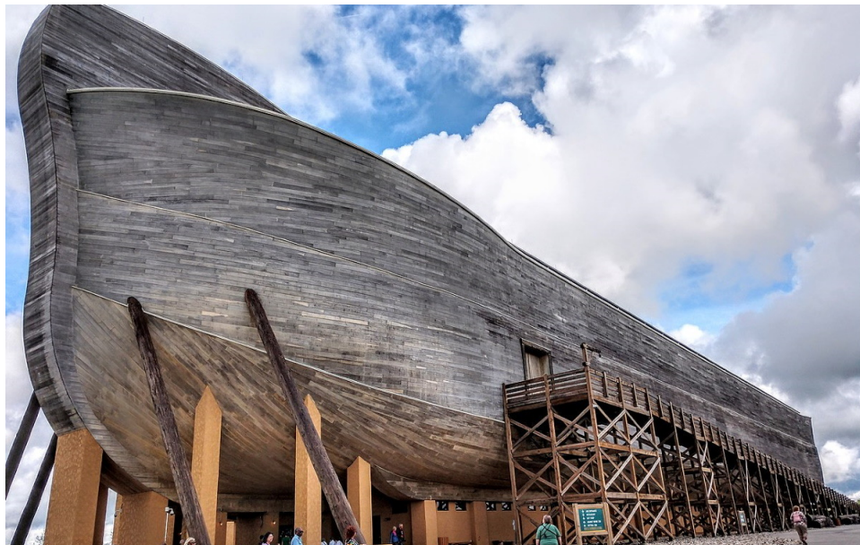
Full-size model of Noah's Ark

preserved Noah, a herald of righteousness, with seven others