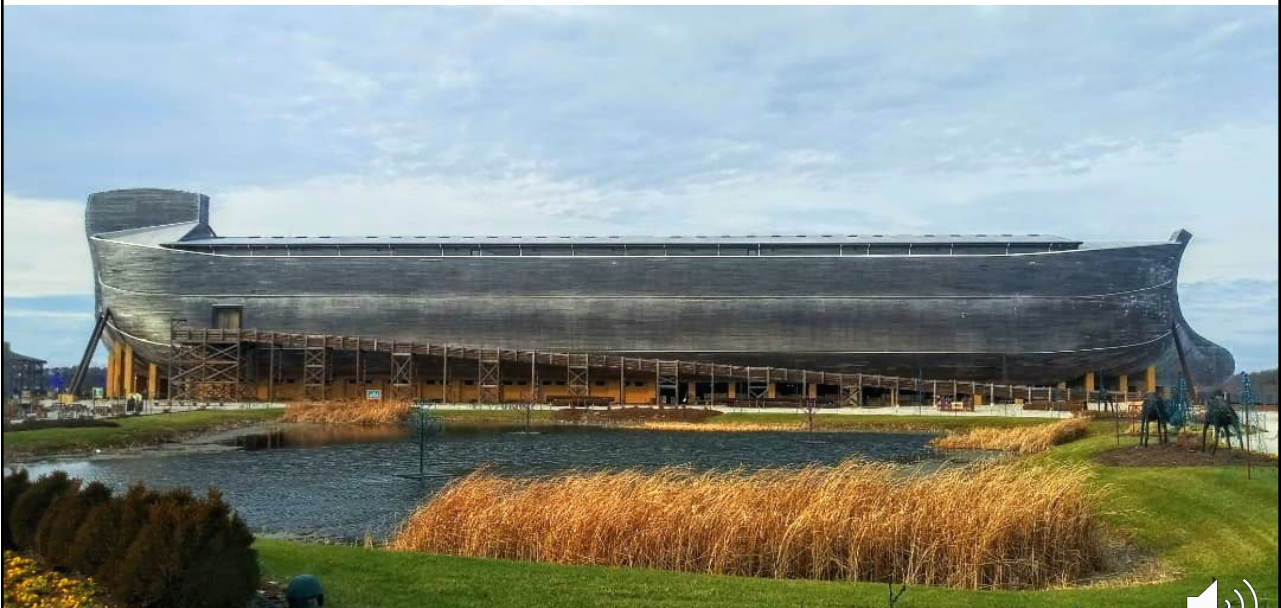
Full-size model of Noah's Ark

the Lord knows how to rescue the godly from trials