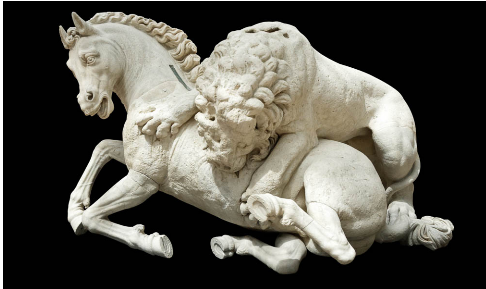
Lion attacking a horse, Hellenistic period

But if you bite and devour one another, watch out lest you be consumed by one another