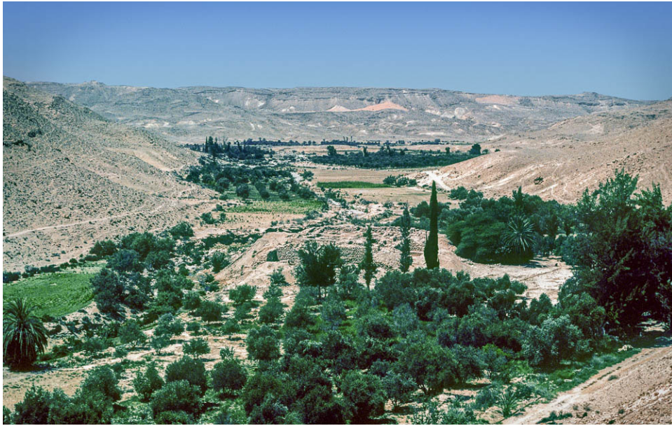
Kadesh Barnea (from the northeast)