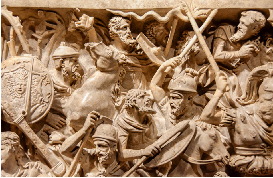
Melee of soldiers and a horseman, from near Via Tiburtina, circa AD 180

The flesh desires what is opposed to the Spirit, and the Spirit is opposed to the flesh